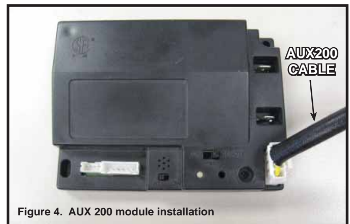
Figure 4. AUX 200 module installation