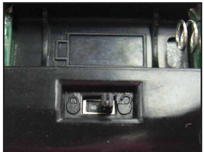
Figure 7. Child Lock Switch

NOTICE: No functions will be usable until child lock feature is disabled.