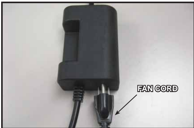
Figure 5. Plug Fan into AUX200 Module