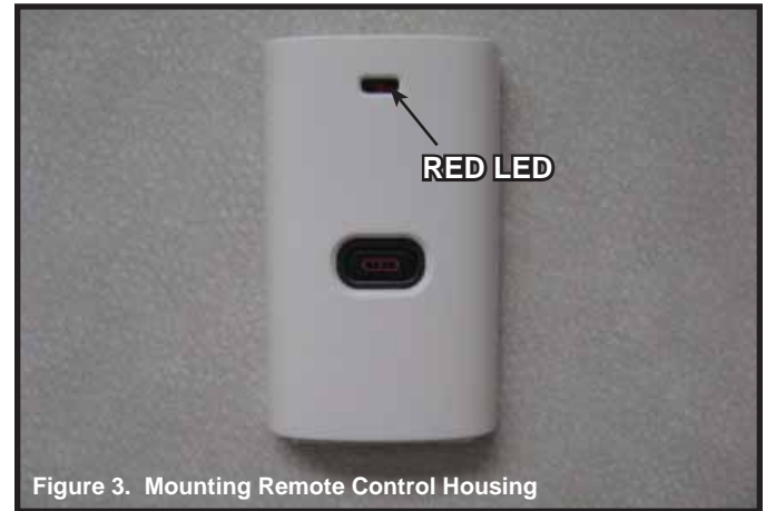
Figure 3. Mounting Remote Control Housing