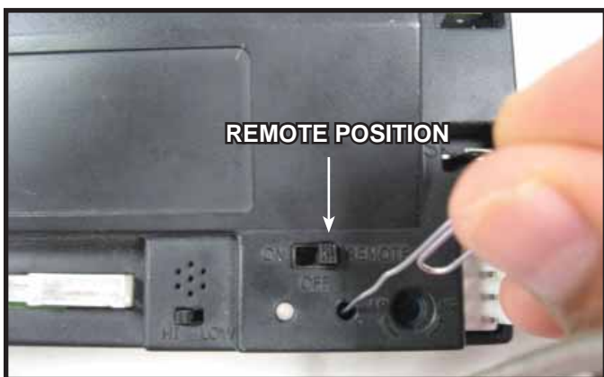
Figure 6. Programming RC200

To clear memory in the control module, use a small item (such as a paper clip) to press and release the LEARN button. Control module will beep once and LED will blink green for 10 seconds DO NOT press any buttons on the remote during the ten seconds that the green LED blinks. The memory will be cleared.