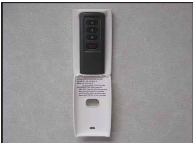
Figure 2. Remote in Housing